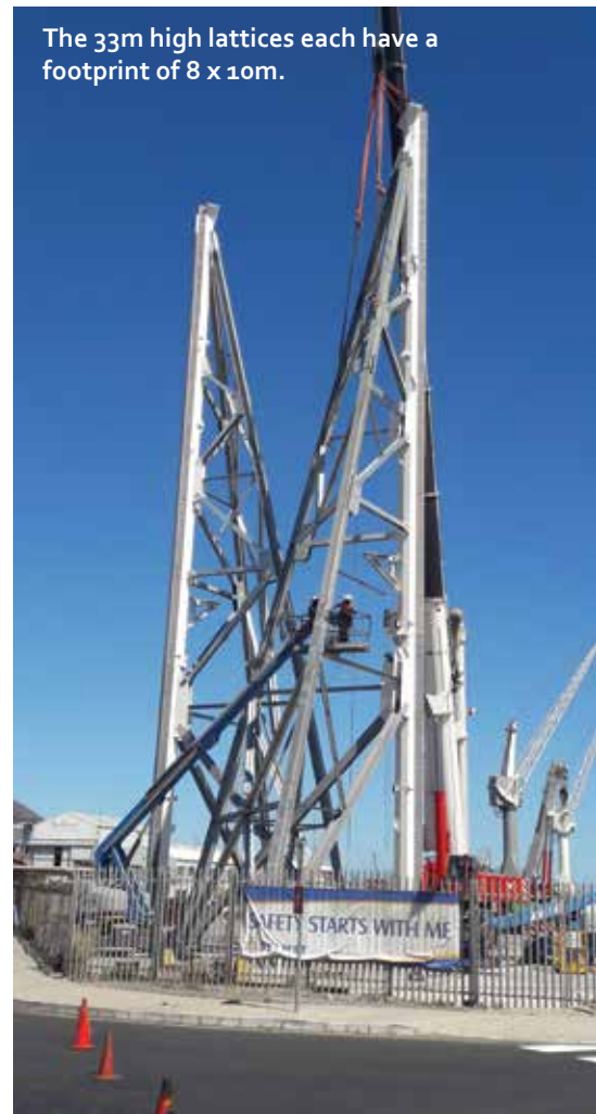
The 33m high lattices each have a footprint of 8 x 10m.

"This means we have accelerated timeframes for De Beers. We are supplying the steel from South Africa and trucking it up to Namibia for production," he adds.