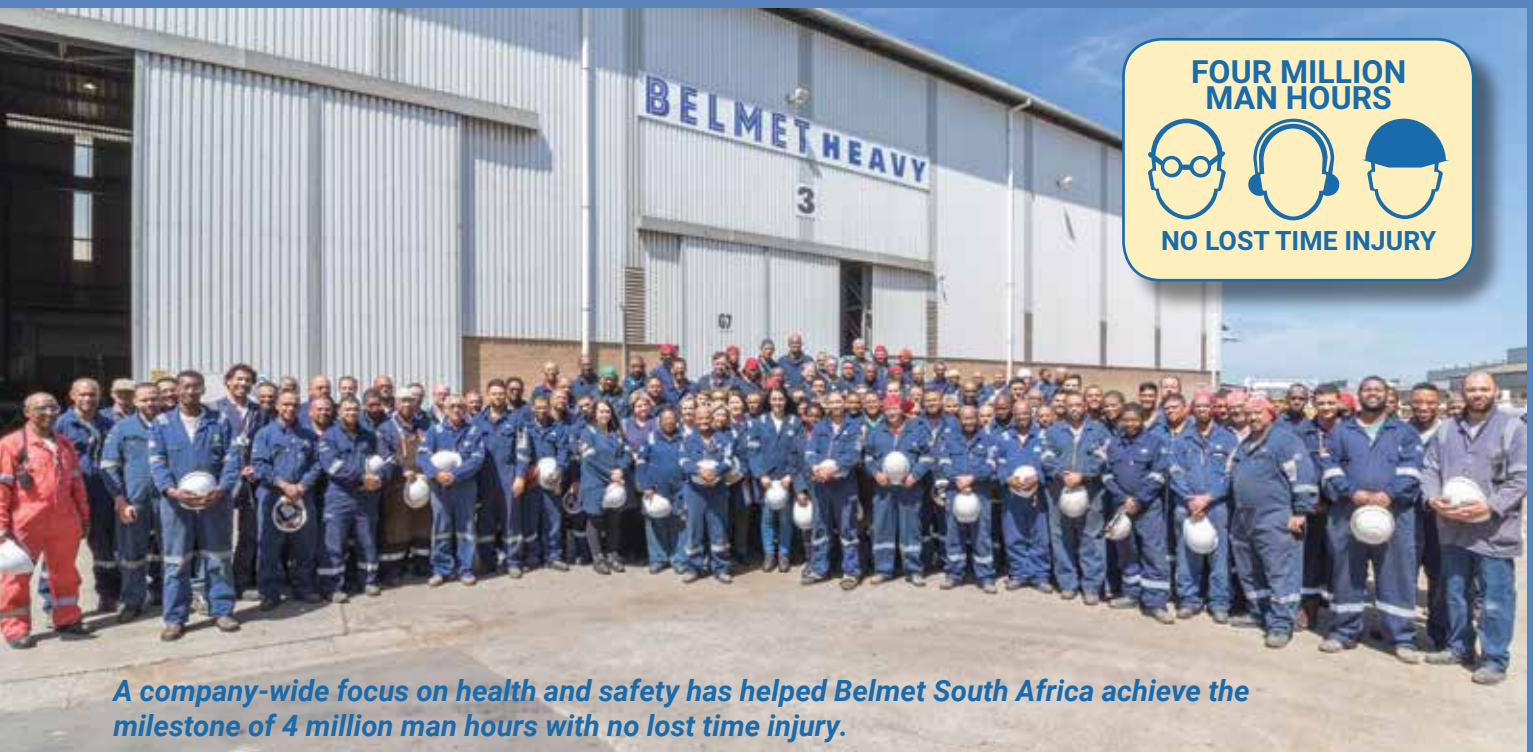
A company-wide focus on health and safety has helped Belmet South Africa achieve the milestone of 4 million man hours with no lost time injury.